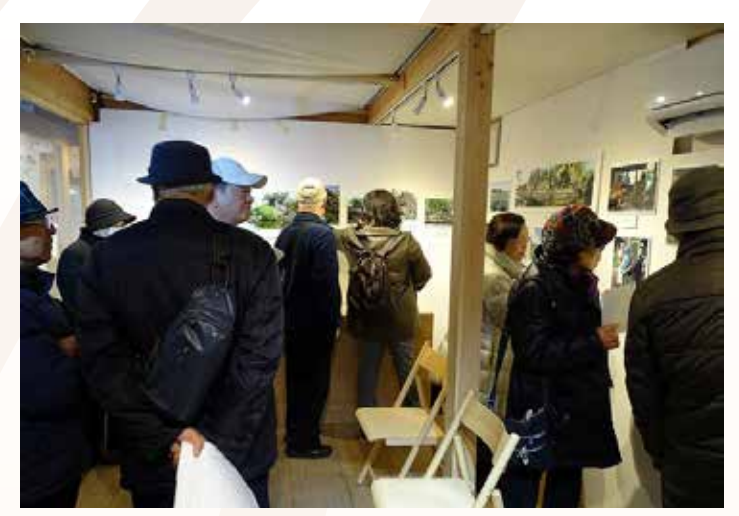
Nan Madol Photographic Exhibition, Tokyo

To celebrate the inscription of Nan Madol, Pohnpei on the UNESCO World Heritage List, we cosponsored "Photographic Exhibition: World Heritage Site Nan Madol: Searching for Traces of Megalithic Culture in the Pacific" with the Kansai Gaidai University in Nara (January 31-February 5, 2016) and Tokyo (February 7-12, 2016), Japan (in collaboration with Tokyo National Research Institute for Cultural Properties). We had 100 visitors at Nara and 150 visitors at Tokyo. The exhibitions were taken up by a major Japanese newspaper, Yomiuri Shimbun.