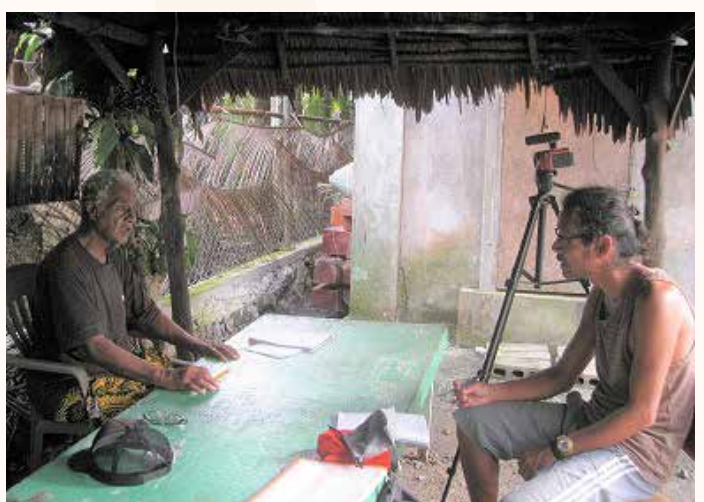
Interviewing the Kapingamarangi chief