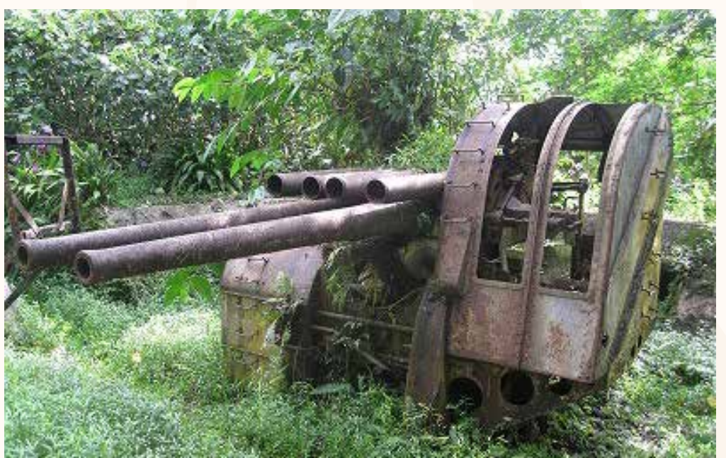
Japanese anti-aircraft gun on Sokehs Ridge

We conducted an online survey to discover the