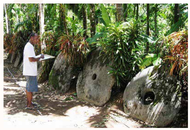
Archaeological training at a stone money site

survey and inventory stone money sites, particularly dancing grounds ('malal,' often called "stone money banks") in May 2015. You can download the report on this archaeological survey of five stone money sites from https://goo.gl/j5GHXw.