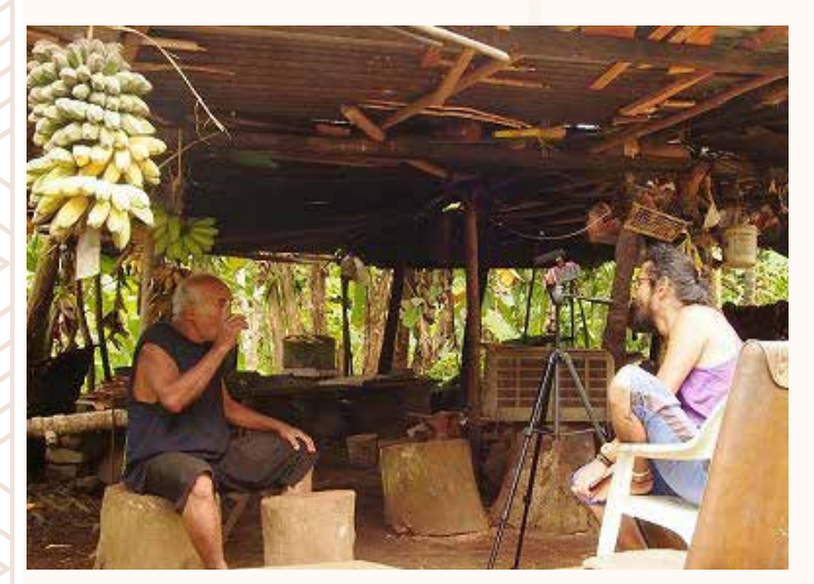
Interviewing a Pohnpeian Elder

the Pohnpei State Historic Preservation Office, which is responsible for cultural administration in Pohnpei State and has been assisting our activities. Due to this, in addition to the outer islands where we have been working, we started to document tradition on the main island of Pohnpei. We have been sharing narrative videos on our YouTube channel (see page 2) to enable Pohnpeians both on Pohnpei and in the USA (where one third of the FSM population has migrated) to view them.