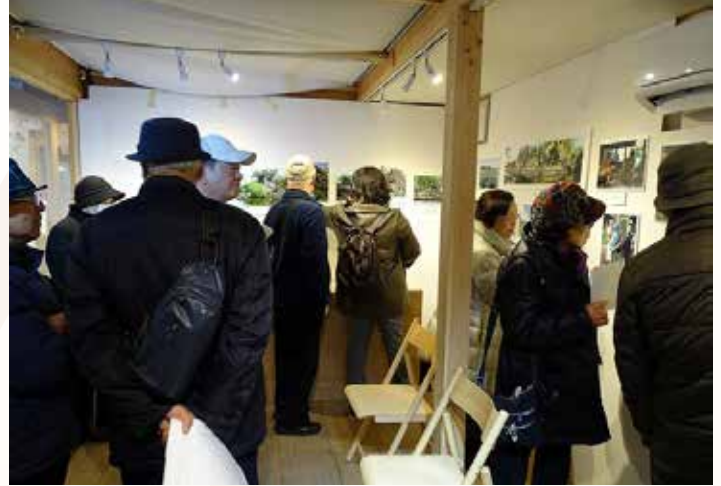
Nan Madol Photographic Exhibition, Tokyo

To celebrate the inscription of Nan Madol, Pohnpei on the UNESCO World Heritage List, we cosponsored “Photographic Exhibition: World Heritage Site Nan Madol: Searching for Traces of Megalithic Culture in the Pacific” with the Kansai Gaidai University in Nara (January 31-February 5, 2016) and Tokyo (February 7-12, 2016), Japan (in collaboration with Tokyo National Research Institute for Cultural Properties). We had 100 visitors at Nara and 150 visitors at Tokyo. The exhibitions were taken up by a major Japanese newspaper, Yomiuri Shimbun.