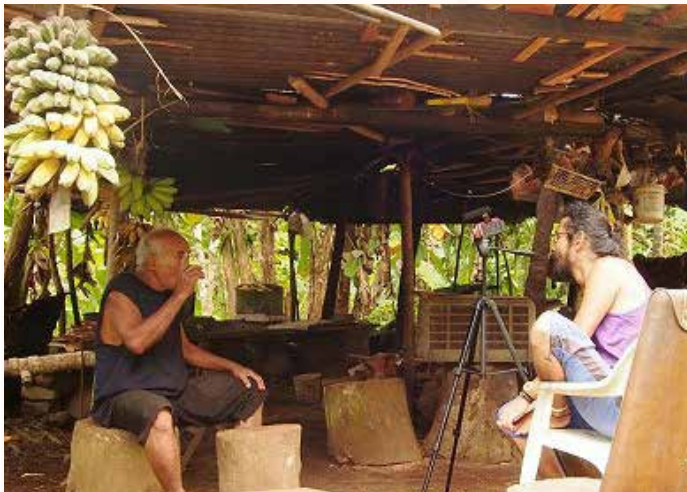
Interviewing a Pohnpeian Elder

the Pohnpei State Historic Preservation Office, which is responsible for cultural administration in Pohnpei State and has been assisting our activities. Due to this, in addition to the outer islands where we have been working, we started to document tradition on the main island of Pohnpei. We have been sharing narrative videos on our YouTube channel (see page 2) to enable Pohnpeians both on Pohnpei and in the USA (where one third of the FSM population has migrated) to view them.