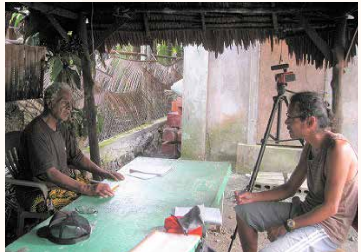
Interviewing the Kapingamarangi chief