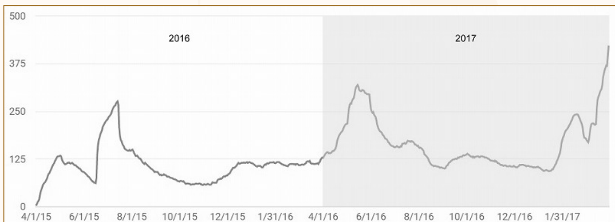
PasiRena YouTube channel's daily views