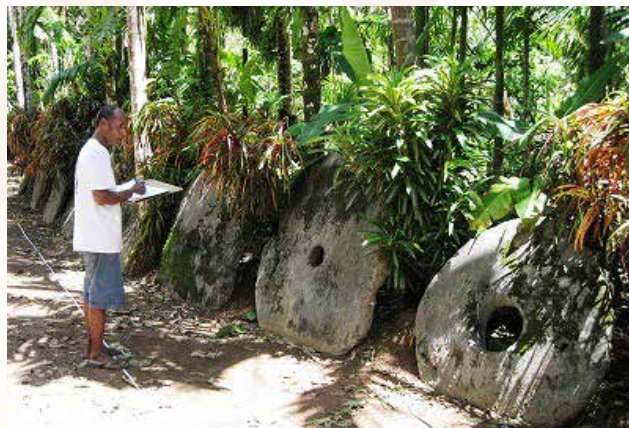
Archaeological training at a stone money site

survey and inventory stone money sites, particularly dancing grounds ('malal,' often called "stone money banks") in May 2015. You can download the report on this archaeological survey of five stone money sites from https://goo.gl/j5GHXw .