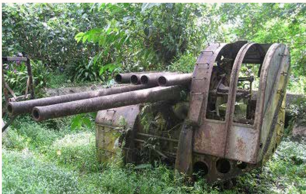
Japanese anti-aircraft gun on Sokehs Ridge

opinions of stakeholders and other interested individuals on the proposed park in September 2016 and obtained 80 responses. We also carried out an archaeological survey in the area in collaboration with the Pohnpei State Historic Preservation Office. Further, we participated meetings of relevant officials and interviewed them. We will produce a development plan, management plan and tour guide manual.